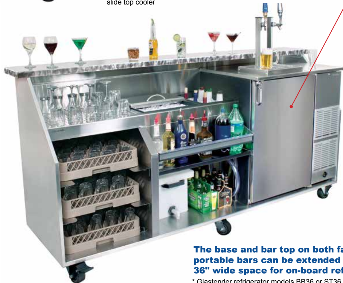
PBGR96-18 Shown with BB36 model refrigerator

Family 2 - Units for glassware come with a glass storage work surface area consisting of a seamless-welded pan with perforated insert and rack slides for storing three 20" x 20" glass racks below.