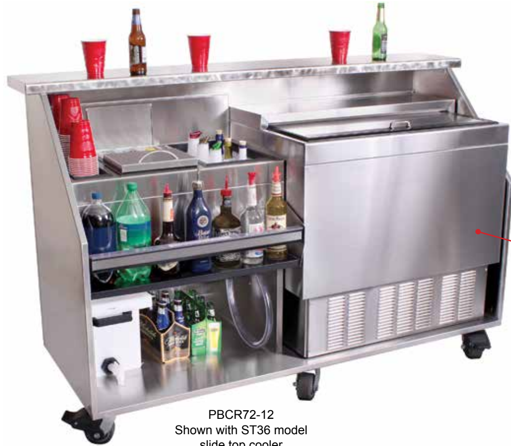
PBCR72-12 Shown with ST36 model side top cooler

Glastender portable bars come in 2 Basic Families based on your style of service.